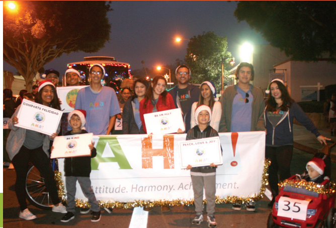
AHA! Peace Builders Spread joy at the Milpas Street Holiday Parade